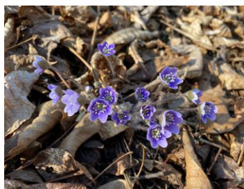
Photo: Tri-lobed Hepatica, the first spring wildflower to find blooming on our riding trails